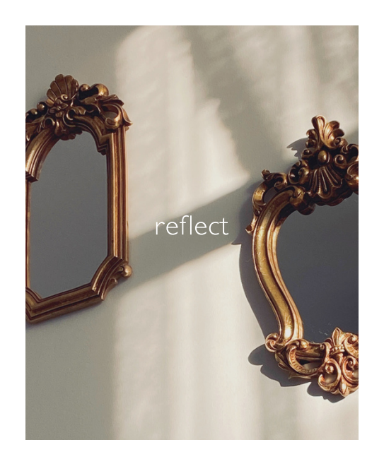
Day 40 Saturday 30 March 2024

'Therefore, my beloved brothers, be steadfast, immovable, always abounding in the work of the Lord, knowing that in the Lord your labour is not in vain.'