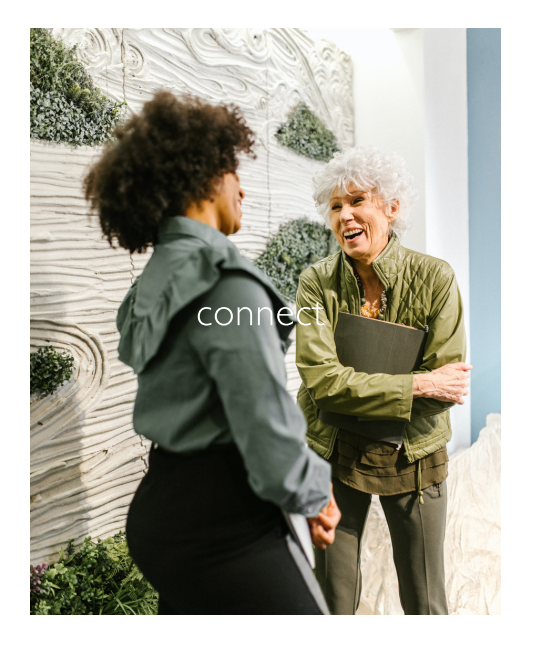
Day 34 Saturday 23 March 2024

'One generation after another will celebrate your great works; they will pass on the story of your powerful acts to their children.' – Psalm 145:4 VOICE