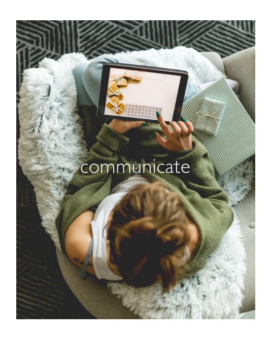
Day 14 Thursday 29 February 2024

'Gracious words are like a honeycomb, sweetness to the soul and health to the body.' – Proverbs 16:24 ESV