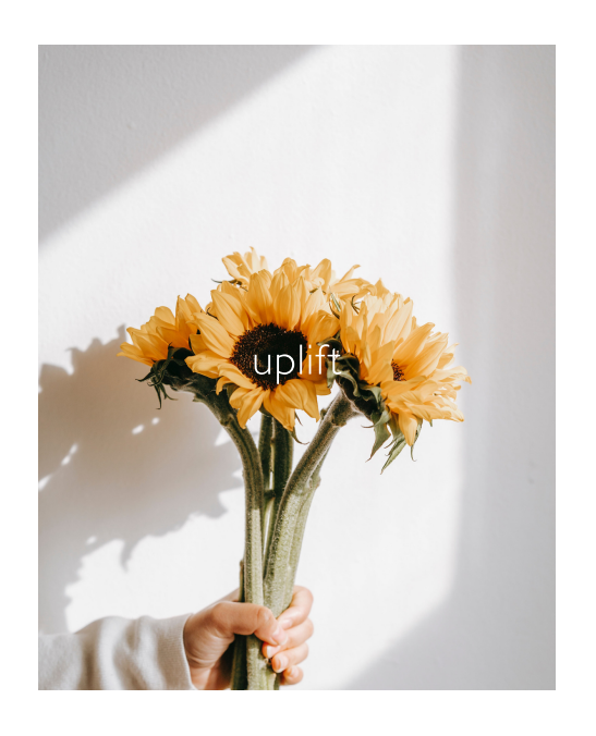
Day 4 Saturday 17 February 2024

'Whoever brings blessing will be enriched, and one who waters will himself be watered.' – Proverbs 11:25 ESV