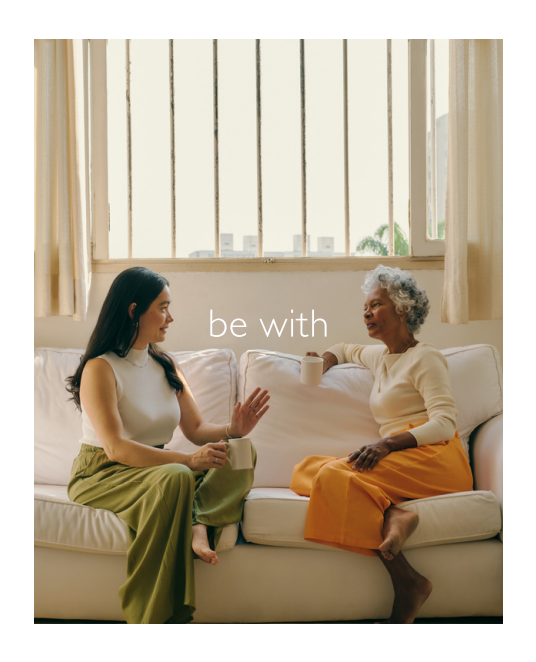
Day 23 Monday 11 March 2024

'Truly I tell you, whatever you did for one of the least of these brothers and sisters of mine, you did for me.'