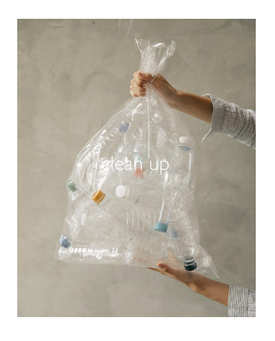
Day 28 Saturday 16 March 2024

'The Lord God took the man and put him in the garden of Eden to work on it and keep it.' – Genesis 2:15 ESV