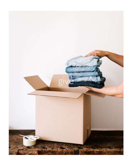
Day 35 Monday 25 March 2024

'Give, and it will be given to you. Good measure, pressed down, shaken together, running over, will be put into your lap. For with measure you will use it will be measured back to you.' – Luke 6:38 ESV