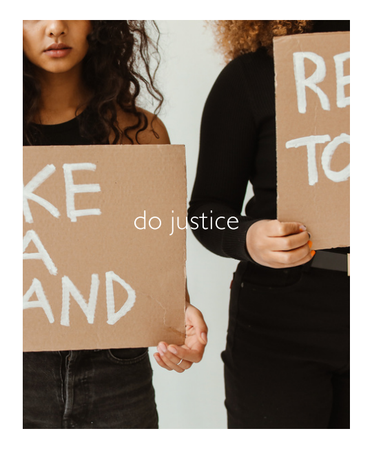
Day / Wednesday 21 February 2024

'He has told you, O man, what is good; and what does the Lord require of you but to do justice, and to love kindness, and to walk humbly with your God?' – Micah 6:8 ESV