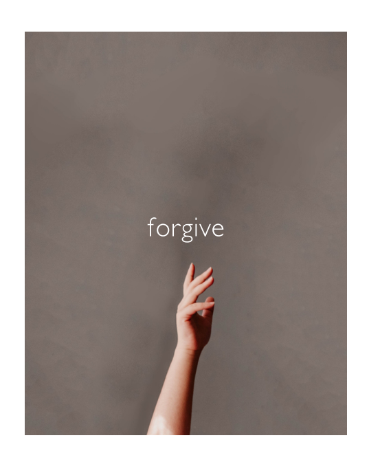
Day 29 Monday 18 March 2024

'Be kind to one another, tender-hearted, forgiving one another, as God in Christ forgave you.'