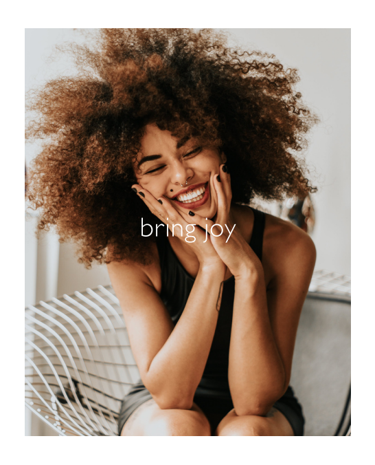
Day I Wednesday 14 February 2024 (Ash Wednesday)

'A cheerful look brings joy to the heart; good news makes for good health.' – Proverbs 15:30 NLT