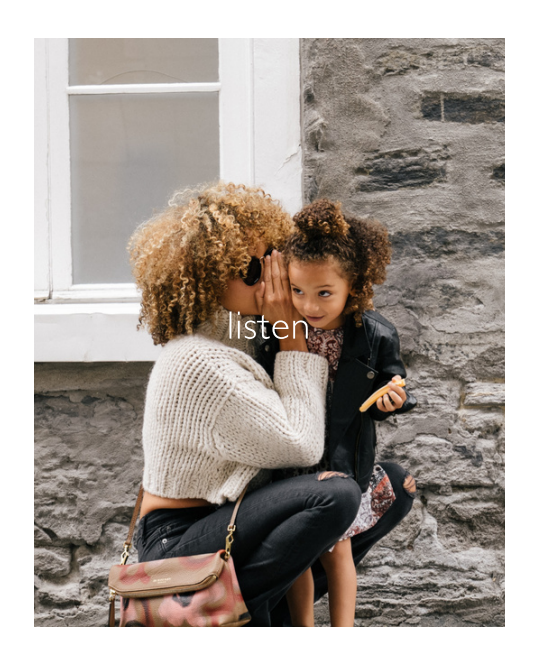
Day 11 Monday 26 February 2024

'Dear brothers and sisters, don't ever forget that it is best to listen much, speak little and not become angry.'