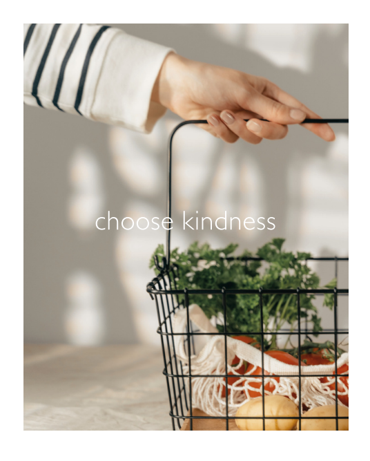
Day 16 Saturday 2 March 2024

'Let all bitterness and wrath and anger and clamour and slander be put away from you, along with all malice. Be kind to one another, tender-hearted, forgiving one another, as God in Christ forgave you'.