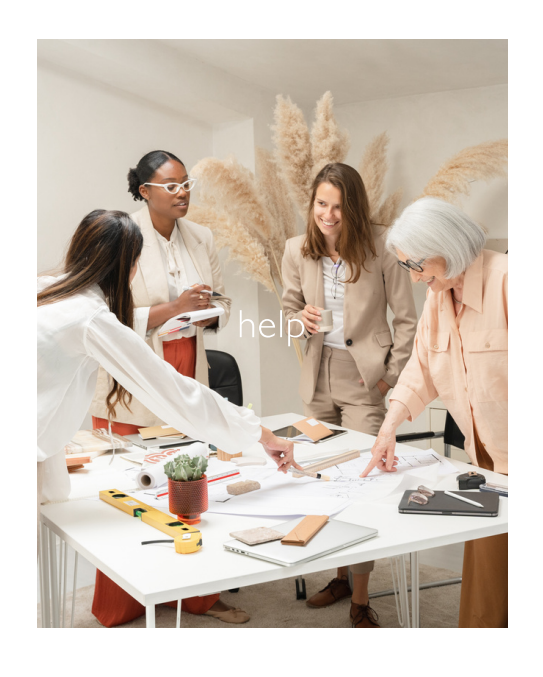
Day 13 Wednesday 28 February 2024

'Let your light shine before others, so that they may see your good works and give glory to your Father who is in heaven.' – Matthew 5:16 ESV