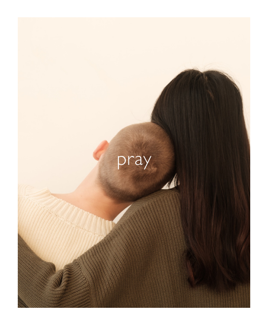
Day 19 Wednesday 6 March 2024

'Do not be anxious about anything, but in everything by prayer and supplication with thanksgiving let your requests be made known to God.' – Philippians 4:6-7 ESV