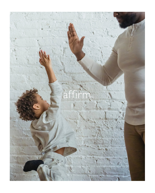
Day 17 Monday 4 March 2024

'Therefore encourage one another and build each other up, just as in fact you are doing.' – I Thessalonians 5:11 NIV