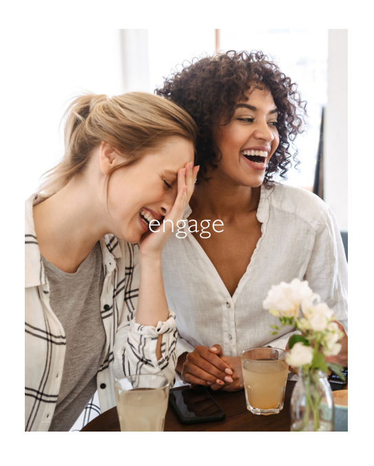
Day 25 Wednesday 13 March 2024

'This is the day that the Lord has made; let us rejoice and be glad in it.' - Psalm + 18:24 ESV