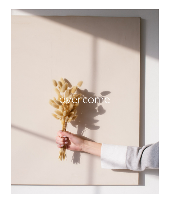
Day 10 Saturday 24 February 2024

'As holy people, whom God has chosen and loved, be sympathetic, kind, humble, gentle and patient. Put up with each other, and forgive each other if anyone has a complaint. Forgive as the Lord forgave you.'