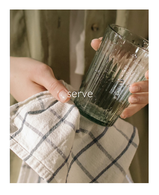
Day 37 Wednesday 27 March 2024

'So if I, your Lord and teacher, have washed your feet, you must wash each other's feet. I've given you an example that you should follow.' – John 13:14-15 GWT