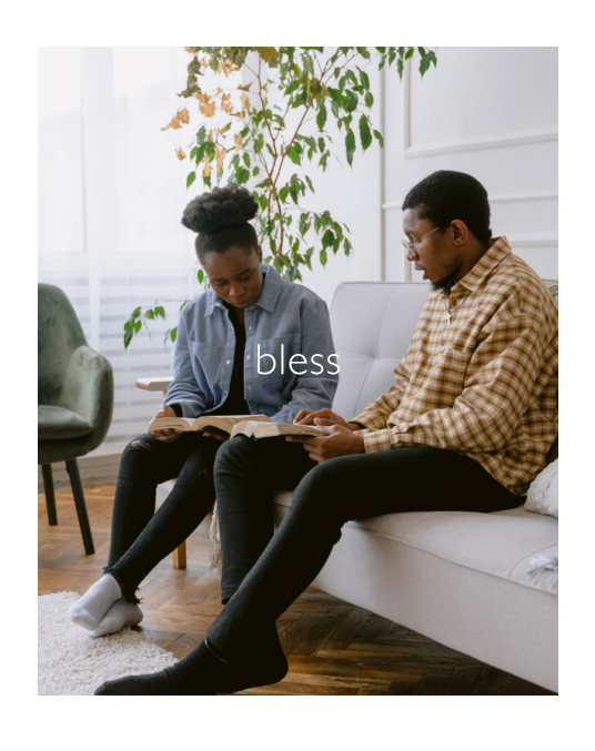
Day 3 I Wednesday 20 March 2024

'So let's not get tired of doing what is good. At just the right time we will reap a harvest of blessing if we don't give up.' - Galatians 6:9 NLT