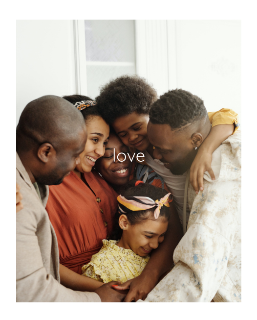
Day 38 Thursday 28 March 2024 (Maundy Thursday)

'A new commandment I give to you, that you love one another. Just as I have loved you, you also should love one another. By this, everyone will know that you are my disciples, if you have love for one another.'