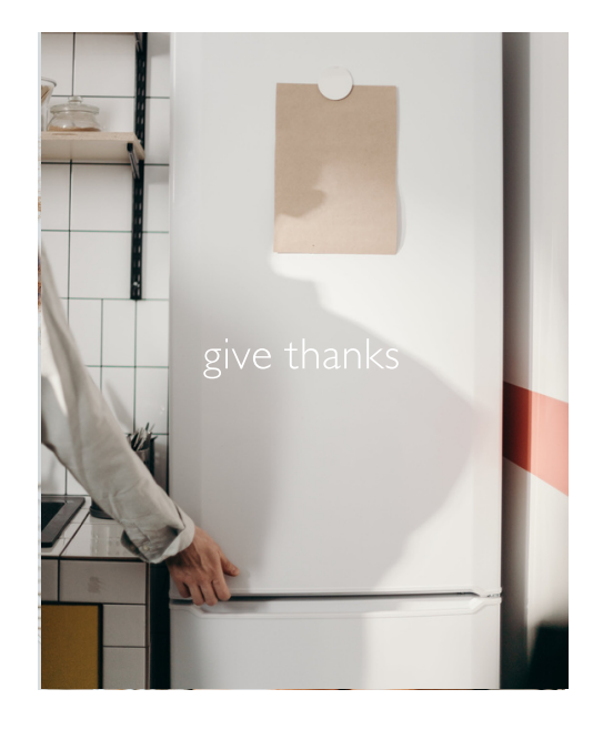
Day 3 Friday 16 February 2024

'Rejoice always, pray without ceasing, give thanks in all circumstances; for this is the will of God in Christ Jesus for you.' – I Thessalonians 5:16-18 ESV