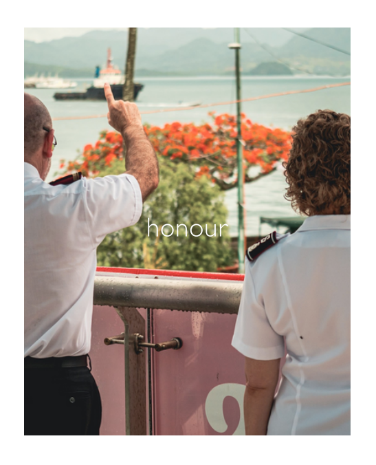
Day 8 Thursday 22 February 2024

'Dear brothers and sisters, honour those who are your leaders in the Lord's work. They work hard among you and give you spiritual guidance. Show them great respect and wholehearted love because of their work. And live peacefully with each other.' — I Thessalonians 5:12-13 NLT