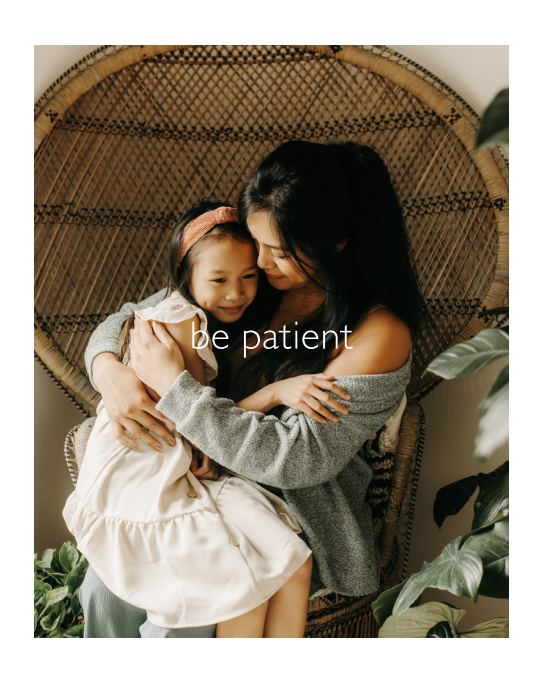
Day 5 Monday 19 February 2024

'Since God chose you to be the holy people he loves, you must clothe yourselves with tender-hearted mercy, kindness, humility, gentleness and patience.'