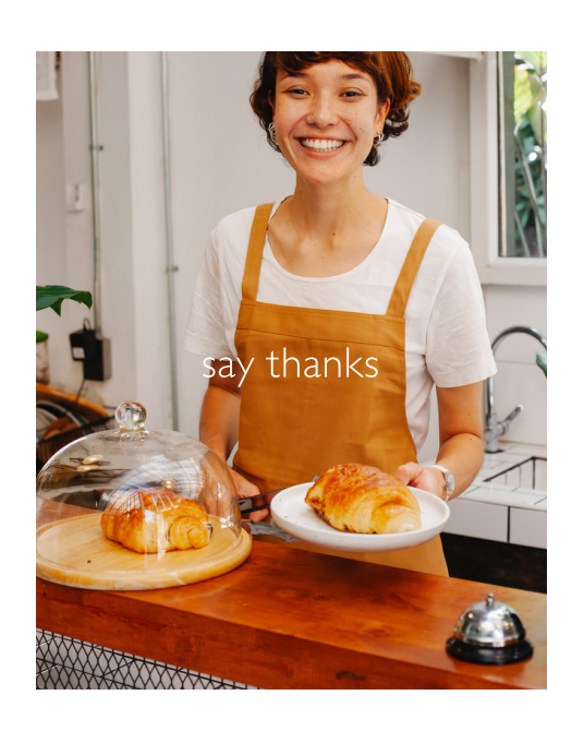
Day 26 Thursday 14 March 2024

'So then, just as you received Christ Jesus as Lord, continue to live your lives in him, rooted and built up in him, strengthened in the faith as you were taught, and overflowing with thankfulness.' – Colossians 2:6-7 NIV