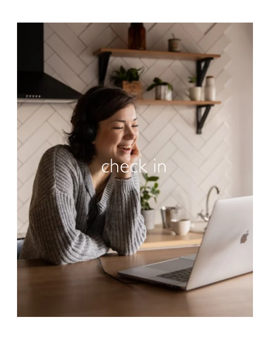
Day 20 Thursday 7 March 2024

'A friend loves at all times, and a brother is born for adversity.' – Proverbs 17:17 NIV